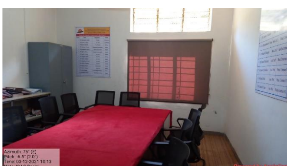
IQAC Documentation Room