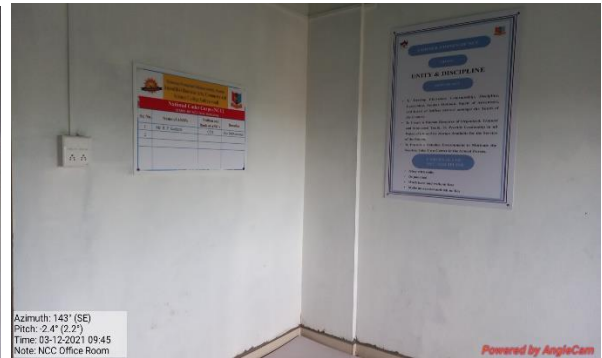
NCC Department Room