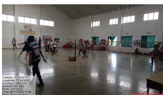
Indoor Sports Facility Center