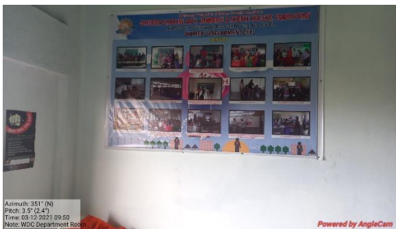
Women Development Cell Room