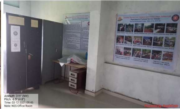
NSS Department Room