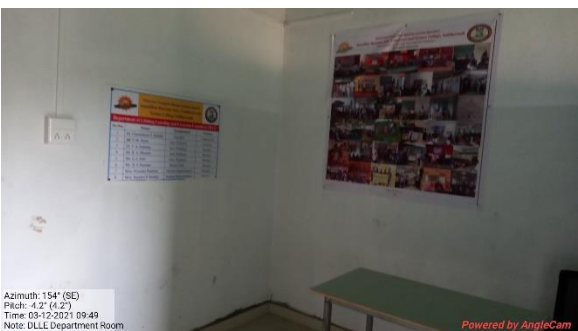
DLLE Department Room