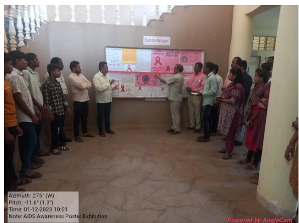
Area for Wallpaper & Poster Exhibition