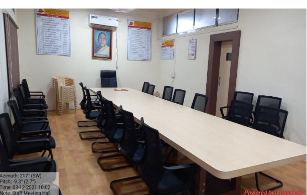
Staff Meeting Room