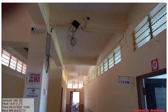
CCTV Camera and WiFi