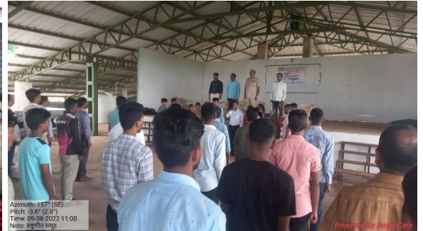
Yoga & Cultural Programme Hall