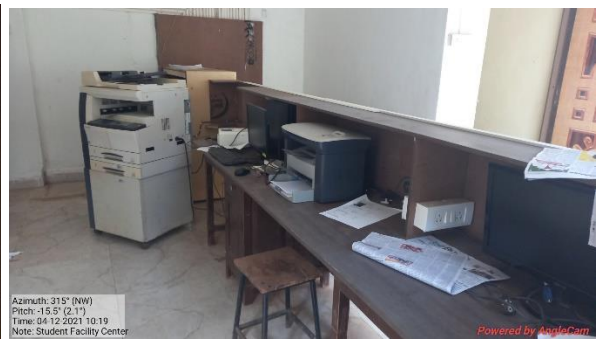
Student Facility Center