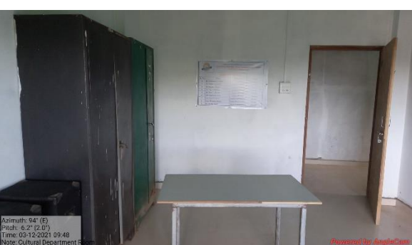
Cultural Department Room